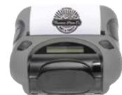
Table Side Receipt Printer / Delivery Label Printer: The SM-T300i is a rugged portable Bluetooth receipt and label printer offering high connectivity and functionality at minimal cost. The SM-T300i is compatible with Apple™, Android™ and Windows™ devices. Dust protected and splash-proof resistant design (IP54 certified), with a 1.5m drop test and long battery life, the SM-T300i is the perfect solution for receipt and label printing in-store or for deliveries.

Pos Receipt Printer / Kitchen Order Printer: The TSP650II combines high print quality and simple set up with Star's renowned reliability – all at great value. Fast 300mm/second thermal receipt printer offering plug-in interfaces for a range of connection options for traditional POS as well as Tablet and Web and Cloud based systems including USB, LAN. TSP654II HI X offers Cloud order printing directly from web sites and on-line ordering systems. Accessories include kitchen buzzer and splash-proof cover