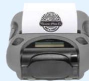
Table Side Receipt Printer / Delivery Label Printer: The SM-T300i is a rugged portable Bluetooth receipt and label printer offering high connectivity and functionality at minimal cost. The SM-T300i is compatible with Apple™, Android™ and Windows™ devices. Dust protected and splash-proof resistant design (IP54 certified), with a 1.5m drop test and long battery life, the SM-T300i is the perfect solution for receipt and label printing in-store or for deliveries.

Pos Receipt Printer / Kitchen Order Printer: The TSP650II combines high print quality and simple set up with Star's renowned reliability – all at great value. Fast 300mm/second thermal receipt printer offering plug-in interfaces for a range of connection options for traditional POS as well as Tablet and Web and Cloud based systems including USB, LAN. TSP654II HI X offers Cloud order printing directly from web sites and on-line ordering systems. Accessories include kitchen buzzer and splash-proof cover