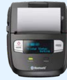
Table Side Receipt Printing, Mobile Vans, Pop Up Stalls, Festivals: The SM-L200 2" / 58mm bluetooth mobile receipt and label printer is super-compact and provide fast, simple connection to Apple iOS, Android, Linux and Windows Mobile devices. It is simple to operate with micro USB charging and can connect using BLE to iOS devices without the need for traditional pairing. It can also print traditional or linerless labels for customer orders and deliveries. Optional charging cradle available.

mUnite Tablet Stands: Star Micronics is proud to offer both function and style with its commercial grade mUnite POS solution stands, built to accompany the Star's POS printer range. Easy to set up, our mUnite stands are suitable for a wide range of solutions for food ordering, KDS, menu display and more. The durable steel stands are easy to set up and are available in either black or white to match existing POS systems. The mUnite stands maintain a clean design while hiding all the cables that keep devices connected, routing power supplies under the counter to recapture counter space.